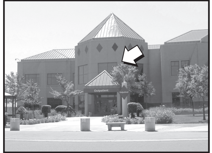
This is the Outpatient entrance.

Nephrology Practice Phone: (559) 353-5770