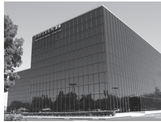
On the fifth floor of The Fifteen 24 Professional Center

Modesto Pediatric Subspecialty Center 1524 McHenry Ave., Suite 570 • (209) 572-3880