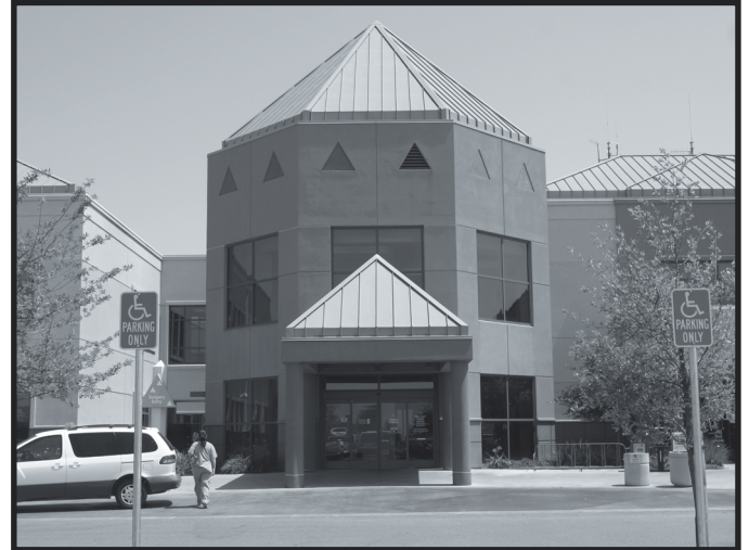
This is the Imaging entrance.

Go to the Imaging entrance from the parking lot.