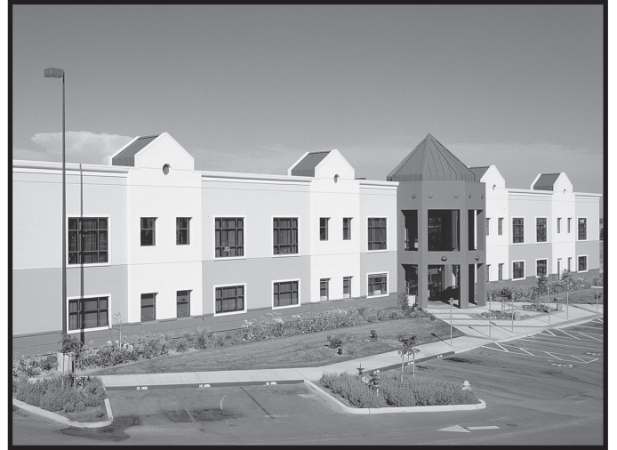
This is the Medical Office Building (MOB).

Go to the Medical Office Building (MOB) located north-east of the Hospital. It is on your left as you drive in.