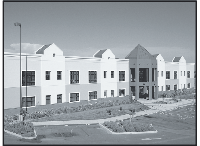
This is the Medical Office Building (MOB).

Go to the Medical Office Building (MOB) located north-east of the Hospital. It is on your left as you drive in.