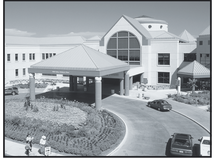
This is the Main entrance.

Hematology Practice Phone: (559) 353-5460